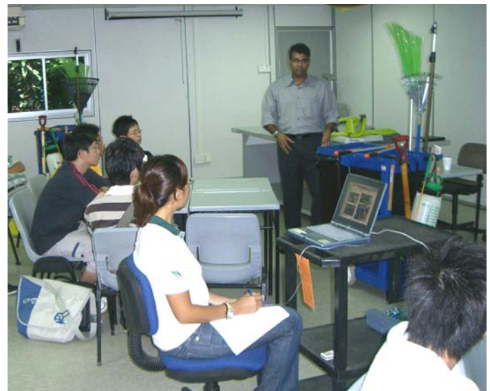
Figure 2: Attending a presentation at National Parks.

Besides working in the classrooms, students are also exposed to the outside world based on the potential projects that they have to work on. Figure 2 shows a briefing session conducted at National Parks where students are required to design landscape tools for use in the parks of Singapore. This makes the project authentic and early exposure to personnel outside Singapore Polytechnic is good for students to realise that studies go beyond the classrooms.